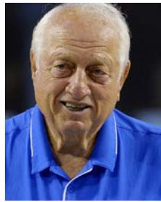
Honoree Tommy Lasorda