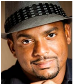
Master of Ceremonies